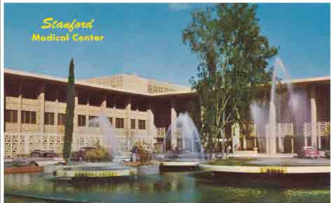
Figure 4. Stanford Hospital Palo Alto, opened in 1959.