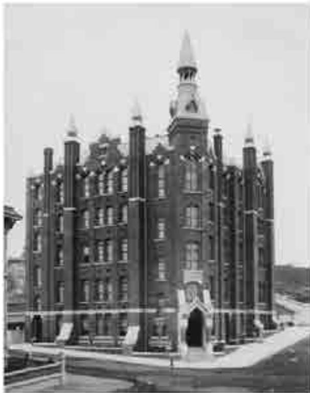
Figure 1. Stanford Medical School circa 1914.